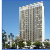
6 Old Ash Street 7 Sempra Building

1 through 2015 when both companies moved to a new high-rise building at 488 Eighth Ave in East 2 Village San Diego. Sempra headquarters buildings are shown here: