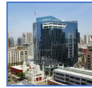
8 New East Village 9 Sempra Building

10 25. The old Sempra building on Ash Street has 21 stories and is 315,545 square feet. 11 The new Sempra building on 8th Ave has 16 stories and is 393,322 square feet.